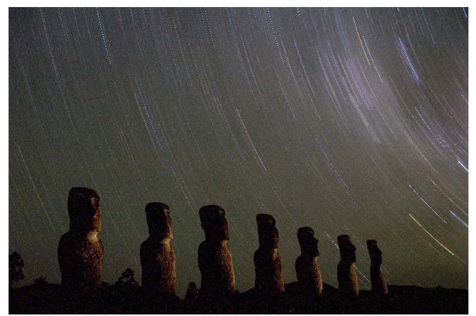
Moai of the Eastern Island