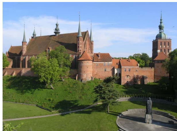
700 years old fortified Frombork Cathedral in a town on a Baltic Sea coast, northeastern Poland. Nicolaus Copernicus lived and worked here as a canon in XVI c.