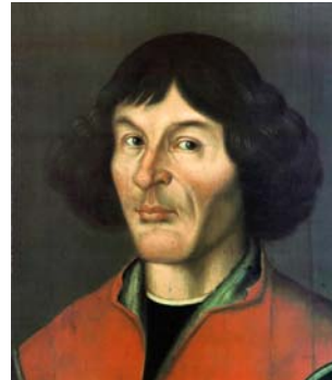
Face of Nicolaus Copernicus reconstructed on a skull founded in a grave. The portrait is known from the Town Hall in Torun, the town where Copernicus was born