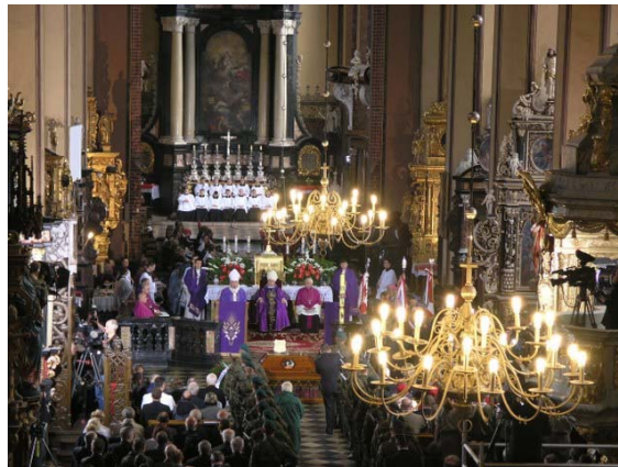
Funeral Mass in the Frombork Cathedral was given by the Primate of Poland on May 22nd, 2010