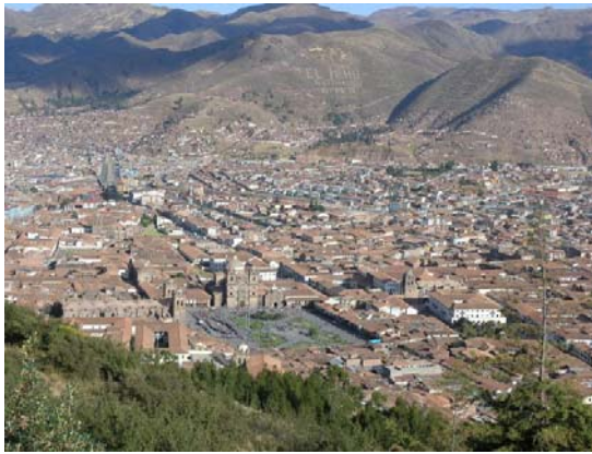
Cuzco, former Inca Empire capital, seat of the Polish scientific station