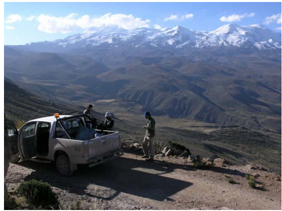
One of the places where Polish archaeologists and conservators carry their work in the massif of Coropuna volcano (6425 m) and surrounding areas