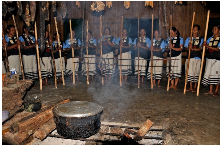
The woman of the tribe Apatami and dancing women of the tribe Ao in Anuranchal Pradesh in India.

12.) The members of the Chapter gave numerous lectures: on festivities, universities, Universities of the Third Age, schools, festivals e.t.c.