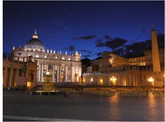
Vatican