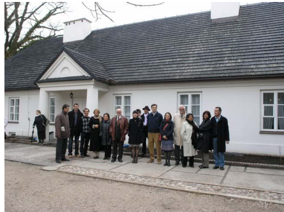
The participants of the session visited Chopin Museum in Zelazowa Wola – the place of birth of the composer